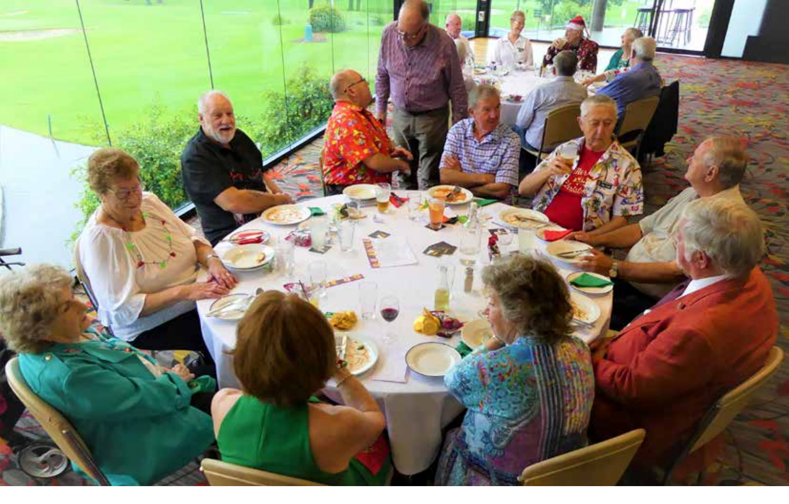
Blacktown & Districts TPI Social & Welfare Club Annual Christmas Luncheon at Fox Hills Golf Club.