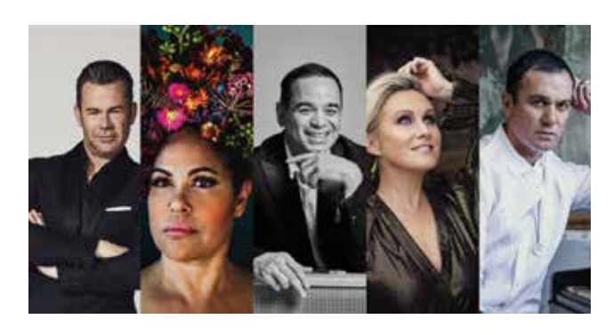
Performers appearing at the NSW Premier's Gala Concert

The Seniors' Festival Expo, featuring a variety of exhibition stands and entertainment, will be operational from 9:30am until 3:30pm and will be held in the Exhibition Centre, Hall 4 at the ICC. Doors into the Premier's Gala Concert Theatre