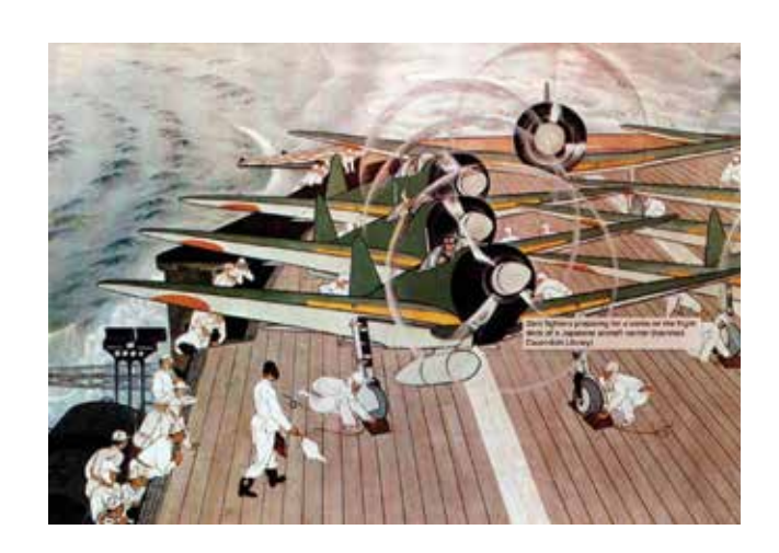
Zero fighters preparing for a sortie on the flight deck of a Japanese aircraft carrier (Marshall Cavendish Library). https://www.navy.gov.au/history/feature-histories/battle-coral-sea