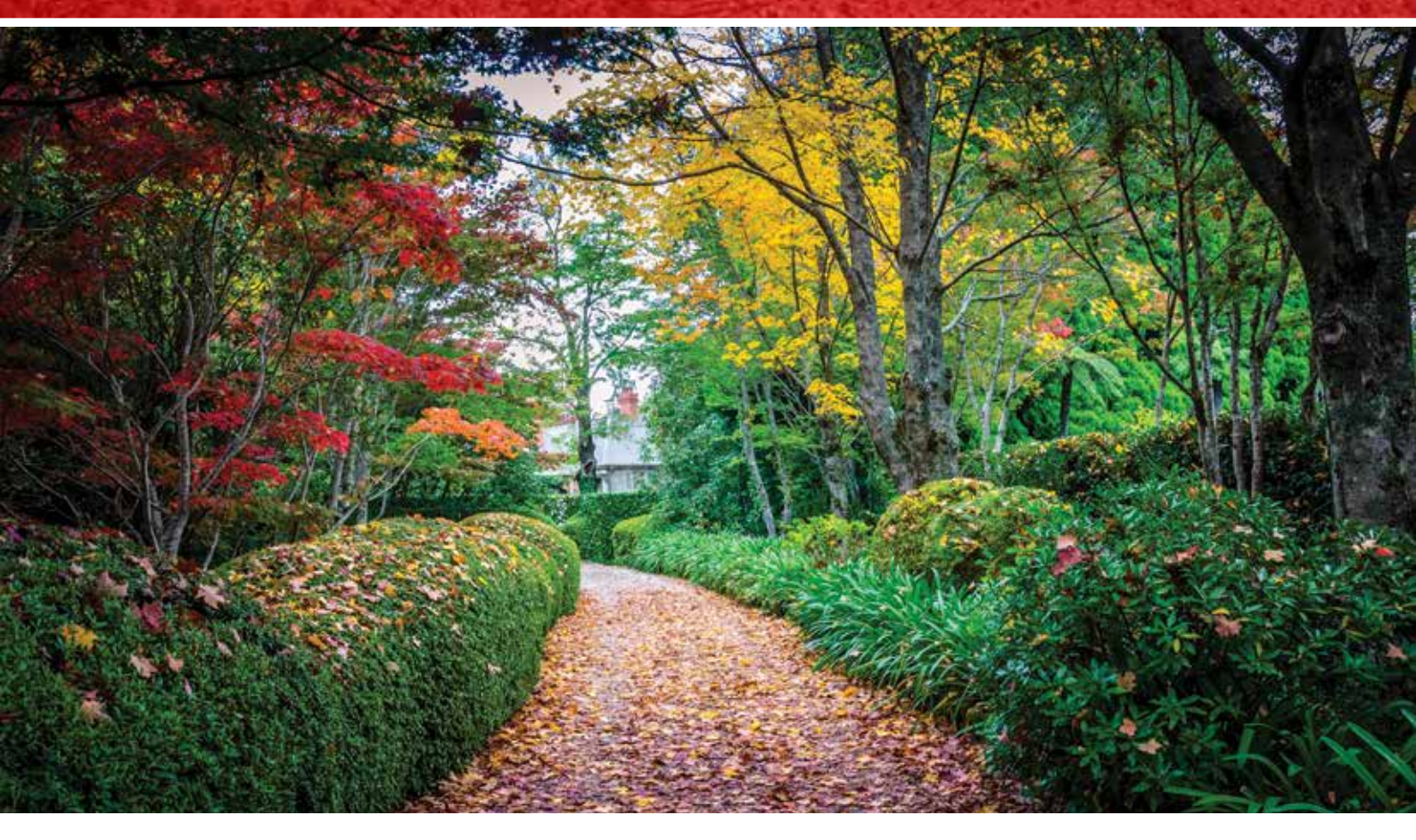
Autumn Garden, Blue Mountains, NSW