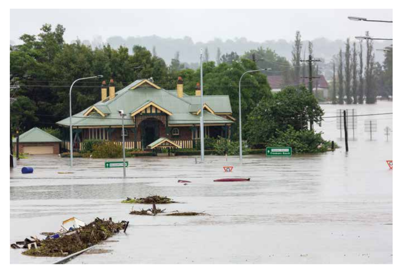
Windsor, NSW, Australia - March 22, 2021. The new bridge over the Hawkesbury river at Windsor submerged after days of heavy rain caused severe and major flooding in the areas.