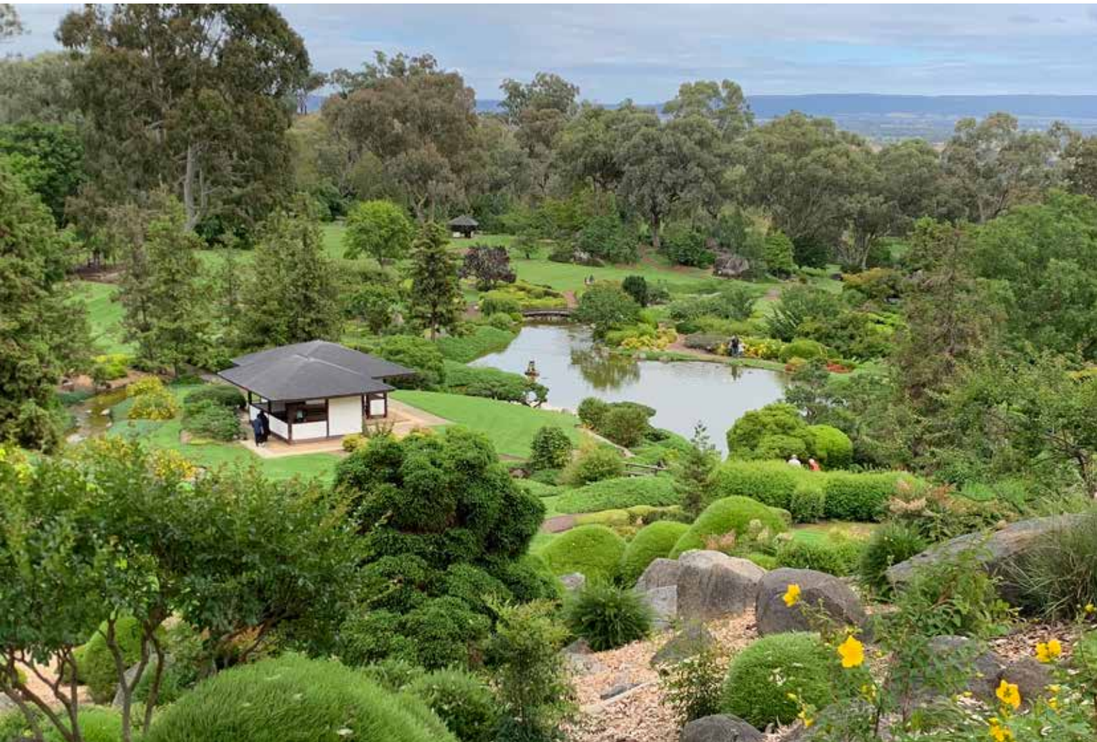
Cowra Japanese Garden and Cultural Centre, NSW.