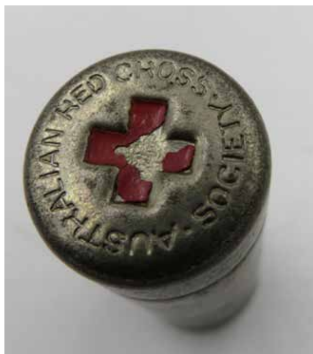
World War II cigarette lighter produced by the Australian Red Cross Society, image provided to eHive by Penshurst RSL Sub-Branch