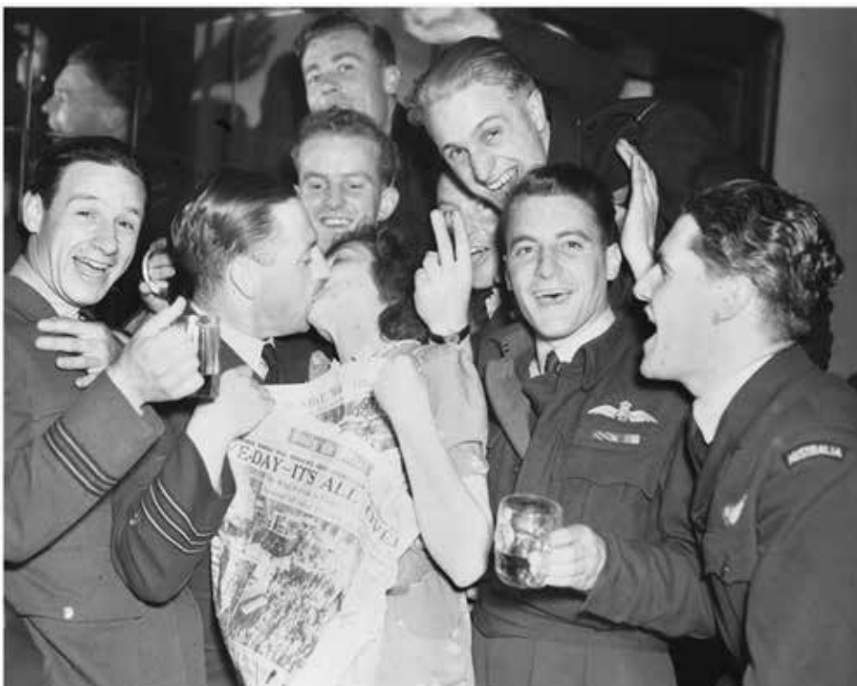
Crews of RAAF No 463 and No 467 (Lancaster) Squadrons who throughout the day had flown more than 500 liberated prisoners of war from German camps back to England, celebrate a belated VE Day in their station mess at RAF Station Waddington, Lincolnshire, in May 1945.

"In bright relief against the darkness which is now passing from Europe, and soon from the entire world." ( http://nla.gov.au/nla.news-article2626721 )