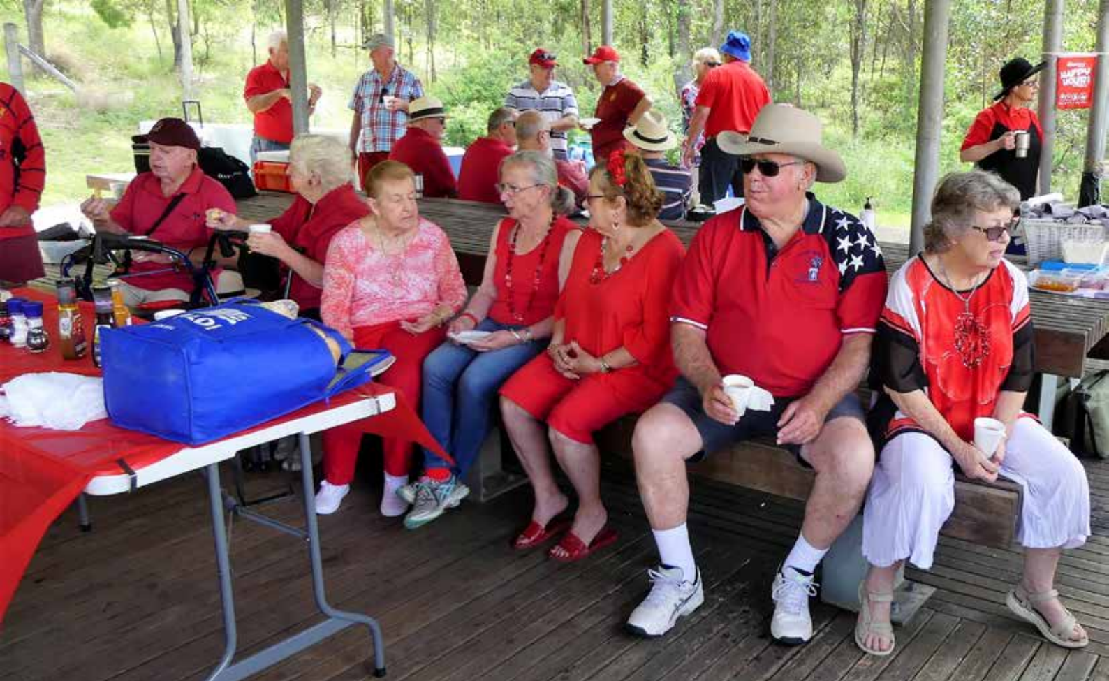
Blacktown & Districts TPI Social & Welfare Club's February BBQ with the colour theme red.