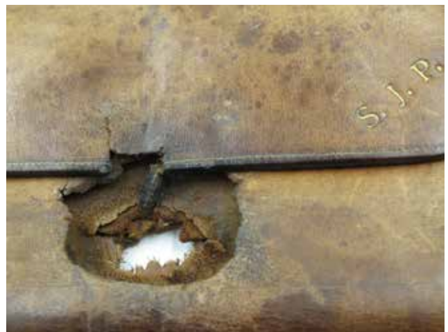
Stan Pickering's wallet with bullet hole

eHive ( https://info.ehive.com/ ) is a digital site repository for over 600,000 collection items worldwide. It is a web-based cataloguing system used by museums, art galleries and private collectors to catalogue and share their collections with the public around the world. There is a small