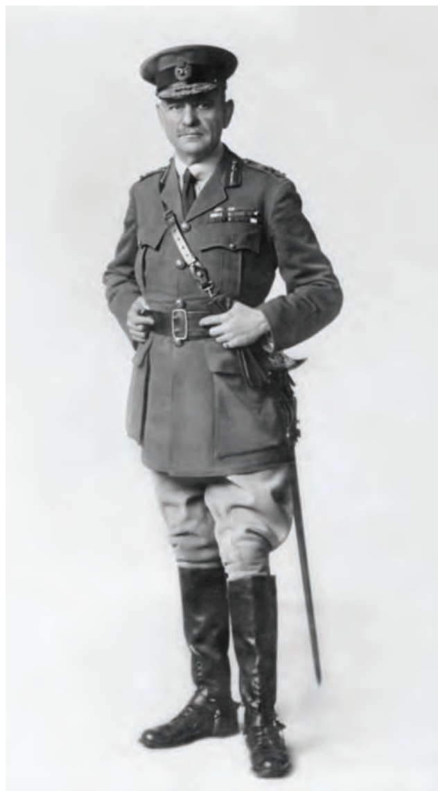
Portrait of Lieutenant General Sir John Monash, one of Australia's most distinguished soldiers during the First World War. London, circa 1918. Photograph, black & white - glass original half plate negative. AWM Accession Number: A02697.

At the end of the of the nineteenth century Monash obtained degrees from Melbourne University in Engineering, Law and Arts. Working as an engineer, Monash played a leading role in the introduction of reinforced concrete into Australia;