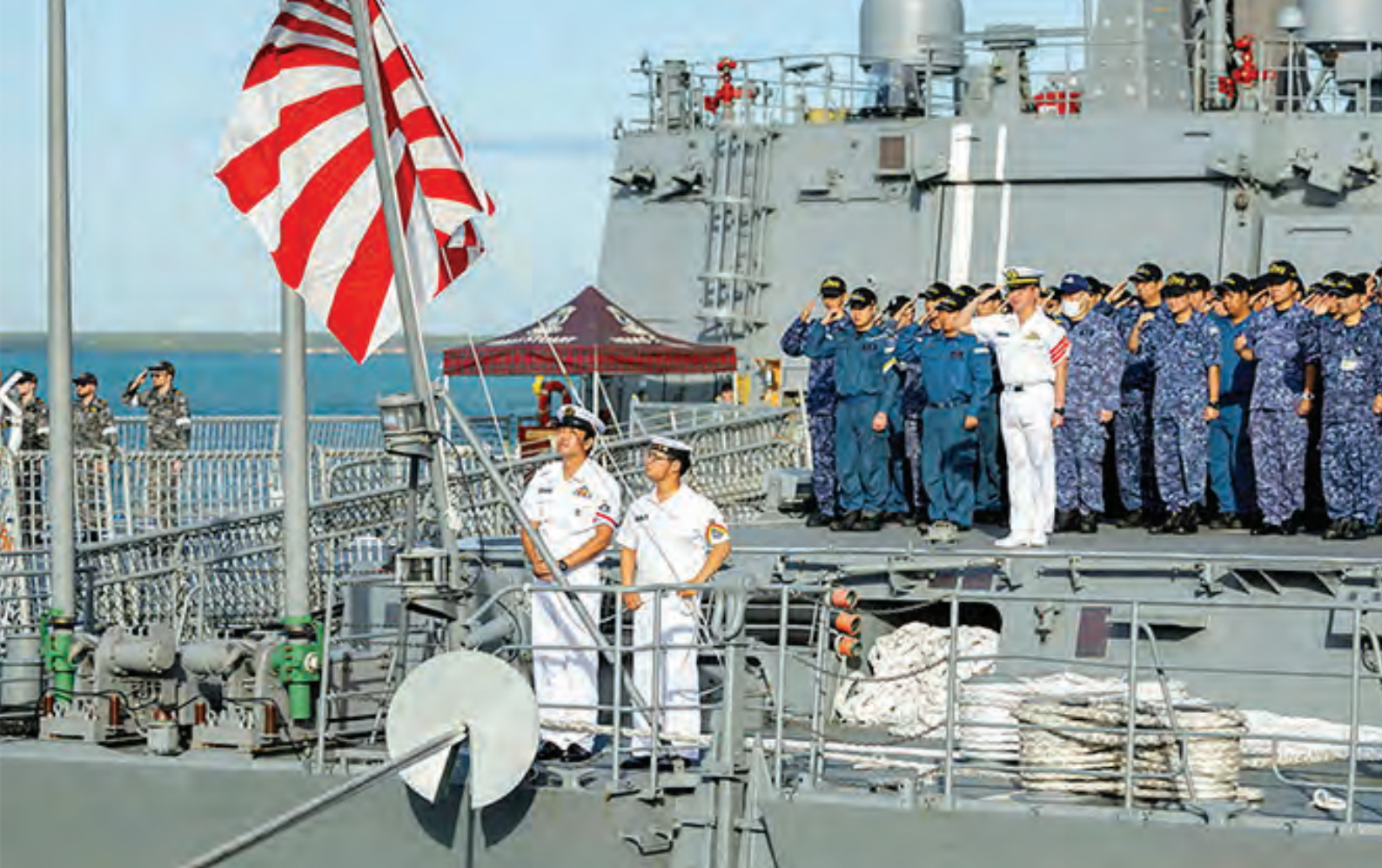
Japanese sailors onboard Japanese Destroyer, JS ARIAKE during colours ceremony, on arrival of their ship berthing Darwin harbour on completion of sea phase of Exercise Kakadu, Darwin NT.