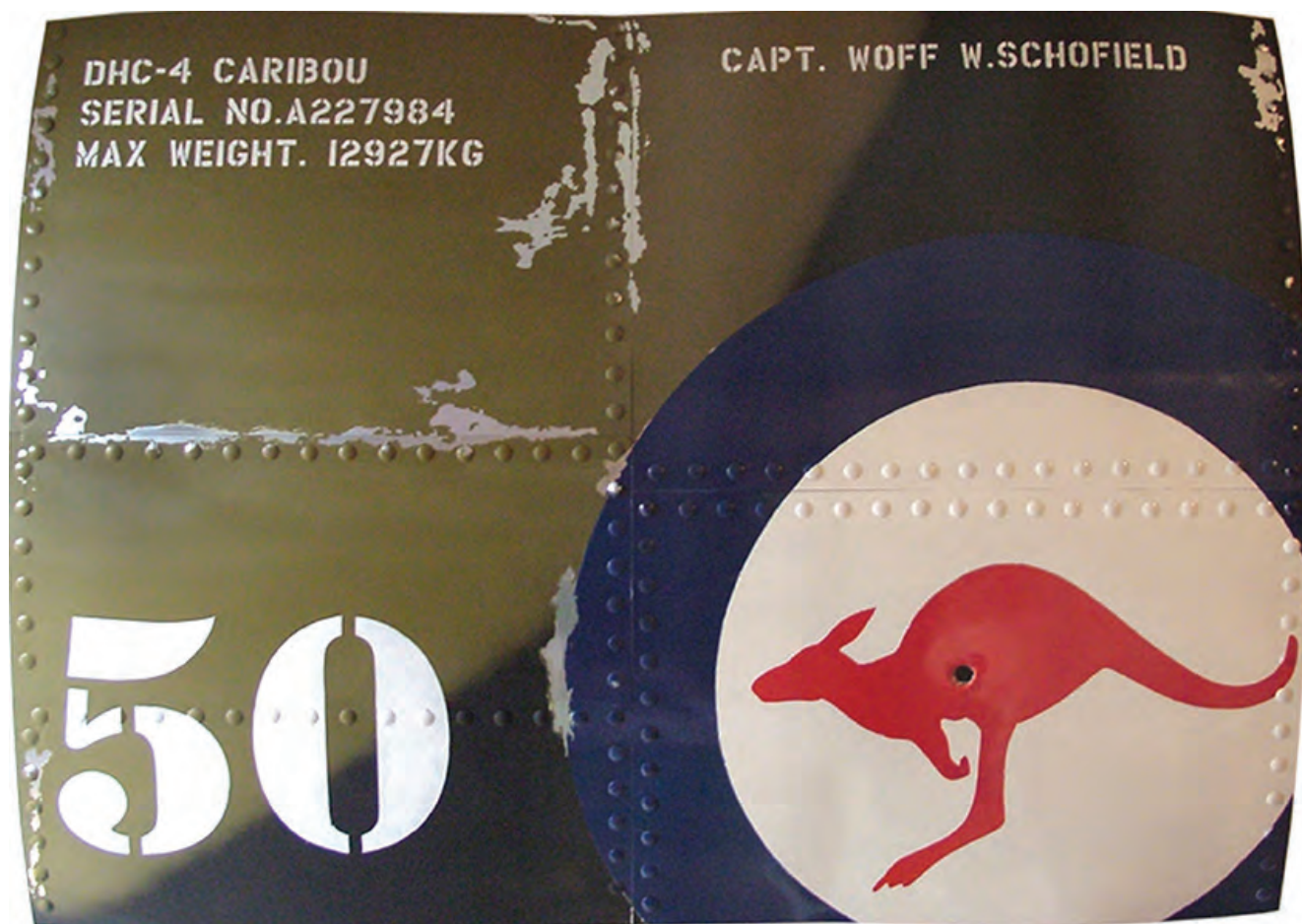
Artwork by Stéphane Portal.

Following up with our phone conversation, please find, attached below, some examples of my artworks.