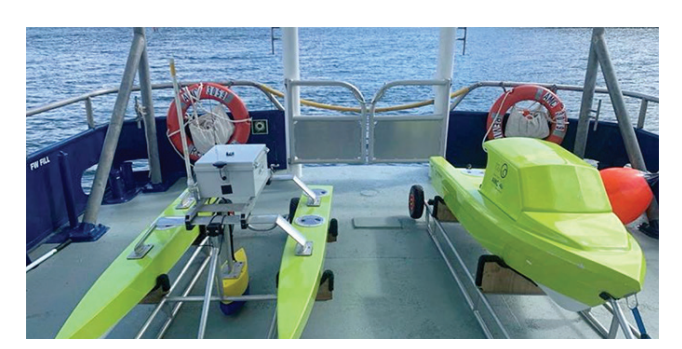
Uncrewed surface vessels are used as part of the training for Navy personnel in Tasmania.

Marine engineers from HMAS Brisbane toured the South-West Regional Maintenance Centre (SWRMC) in San Diego, United States, as part of a scheduled maintenance period to upgrade the ship's systems. Read more here.