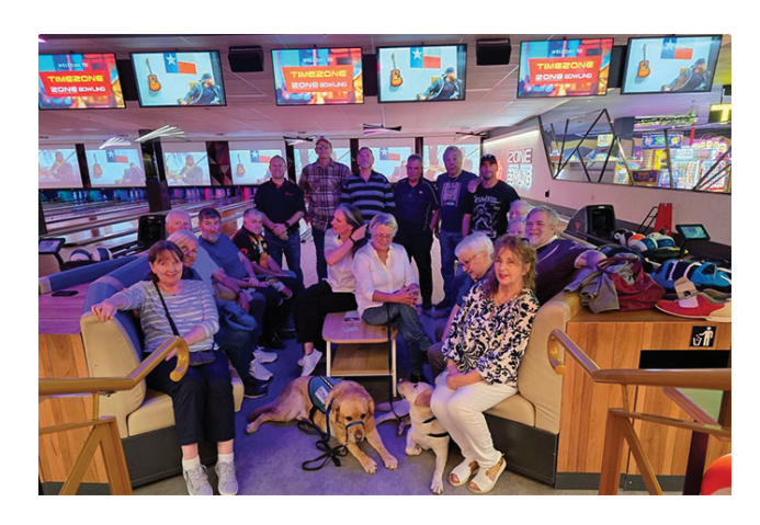
A bowling outing with members of the Nowra/Shoalhaven Veterans' Hub Community.