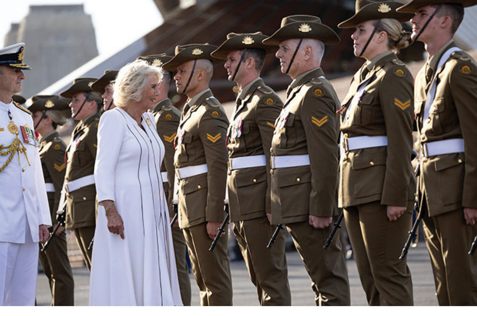
Her Majesty the Queen inspecting members of the Royal Australian Corps of Military Police as part of the Royal Honour Guard.