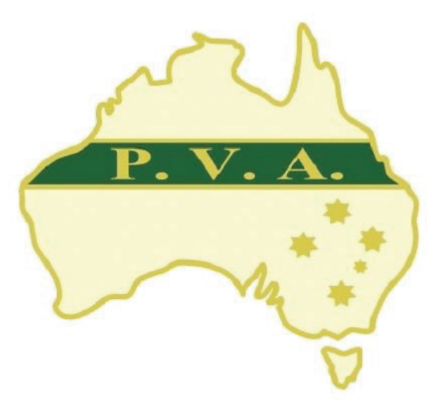
Supported by the Blacktown RSL Sub-Branch