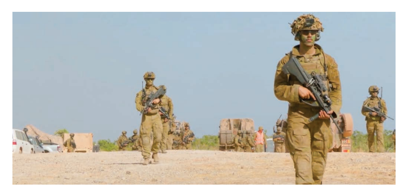
Soldiers from the 5th Battalion, Royal Australian Regiment supported by callsigns from the 1st Combat Engineer Regiment and 8th/12th Regiment, Royal Australian Artillery, conducted a life fire assault on a feature located in the Mount Bundey Training Area, Northern Territory, as part of Exercise Predators Run 2024. See video of Exercise Predators Run 2024 here.