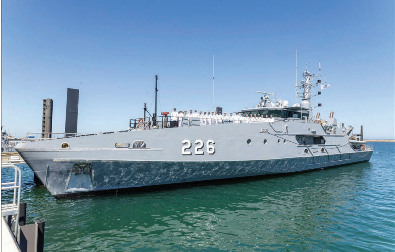
Ship's company of ADV Cape Hawke line the upper decks after the completion of the ADV Cape Hawke Acceptance Ceremony at the Austal Shipyard, Henderson, Western Australia.

our partnership with defence industry in action. It also supports the Government's Future Made in Australia agenda, and our commitment to growth within the defence industry, through the delivery of Defence shipbuilding projects on shore and boosting our sovereign supply chain."