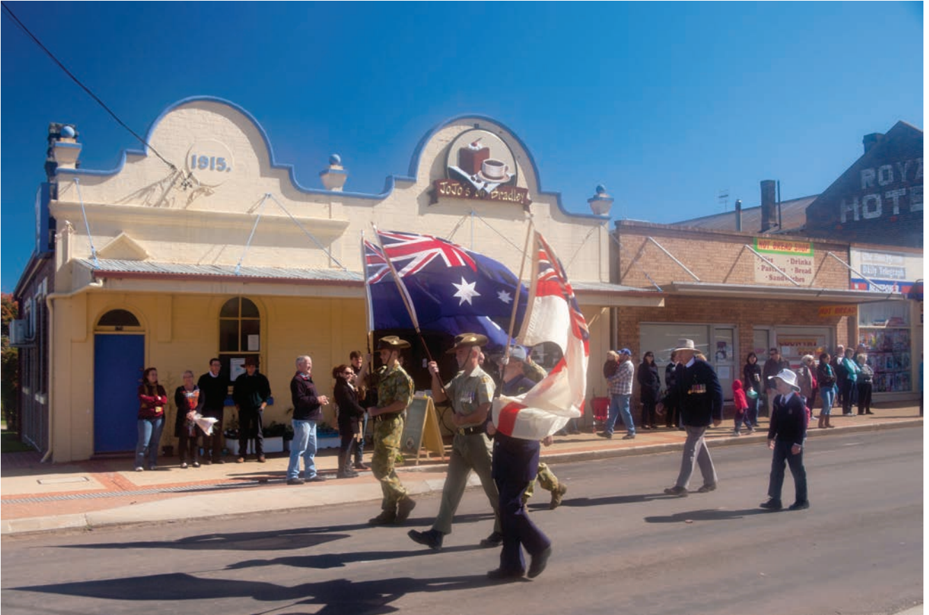
ANZAC Day parade through main street of Guyra, in northern New South Wales.

More than 600 commemorative events will take place across NSW on Anzac Day in 2026. This year Anzac Day, April 25, falls on a Saturday and NSW will join Western Australia and the ACT in observing a public holiday the following Monday, 27 April. Details of commemorative events for Anzac Day in the Sydney CBD and across NSW can be found here