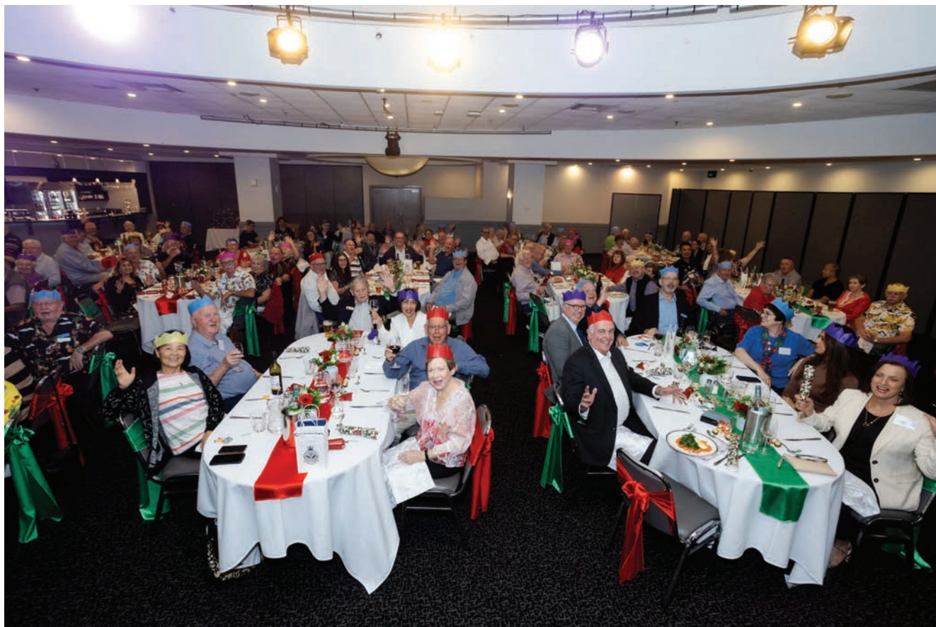
TPI NSW members, staff and guests at the Christmas Luncheon, 2 December 2025.