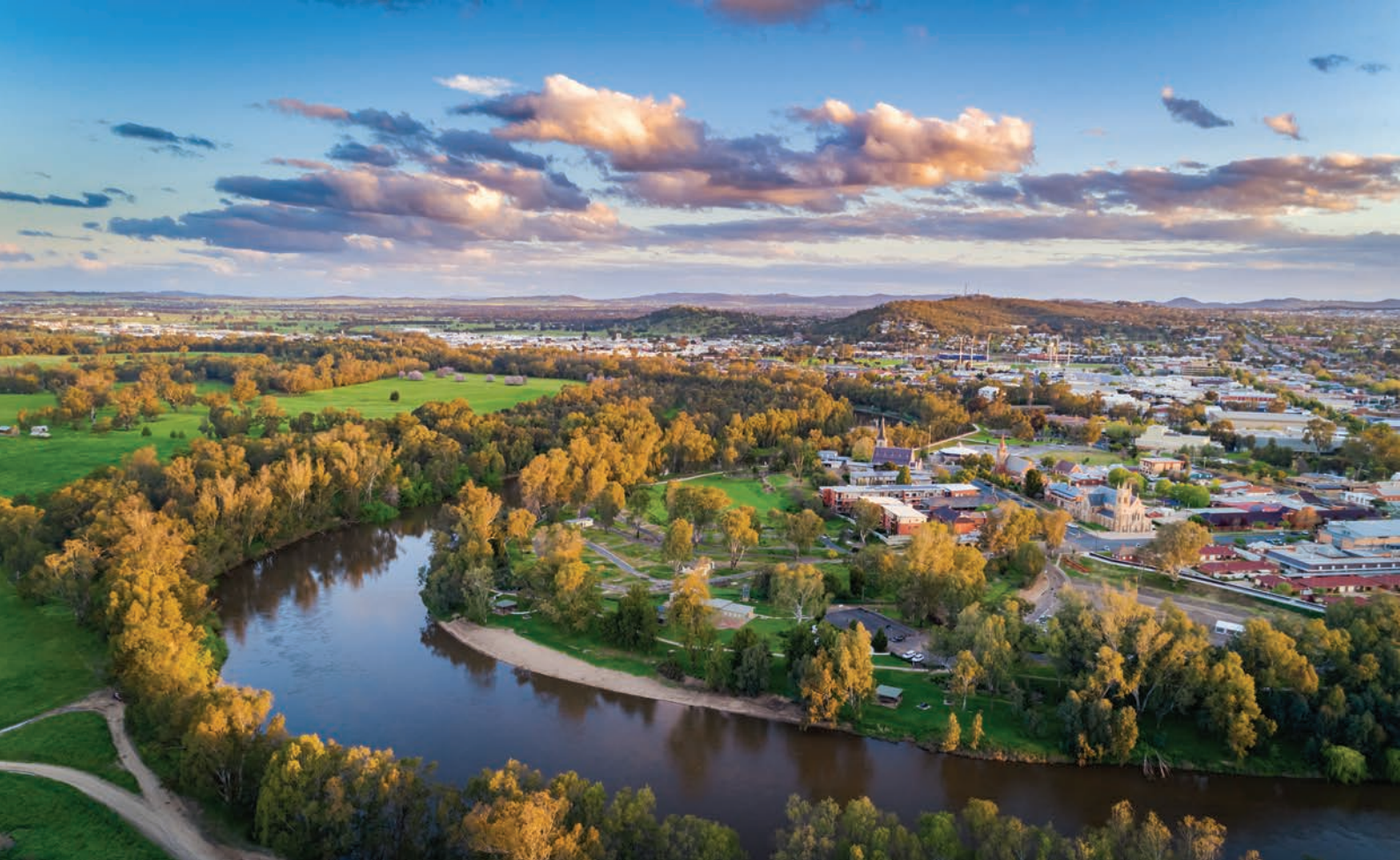
Sunset over the Murrumbidgee River in Wagga Wagga, NSW, aerial drone view.