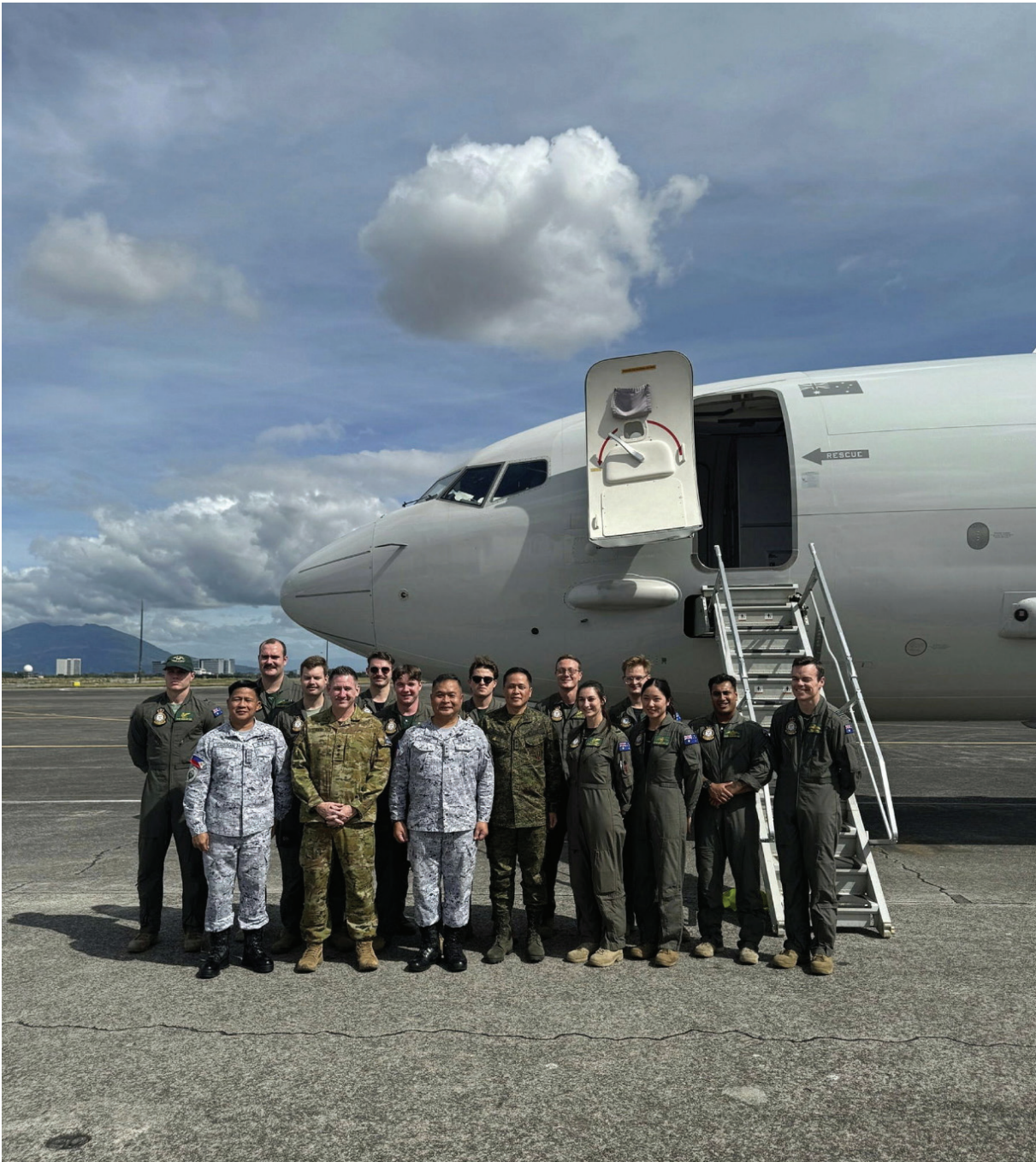
Royal Australian Air Force (RAAF) aviators with Armed Forces of the Philippines (AFP) senior leaders and representatives with a RAAF P-8A Poseidon at Clark Air Base in the Philippines.

conducted a subject matter exchange with members of the Philippine Air Force, focusing on maritime ISR operations.