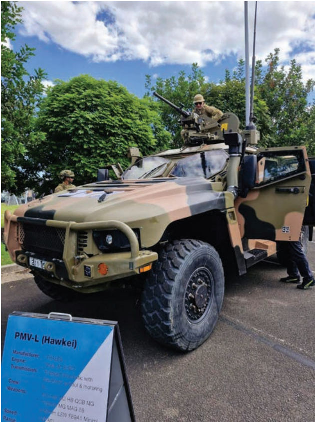
PMV-L Hawkei vehicle at the Army Open Day, Holsworthy Barracks near the RAE museum.