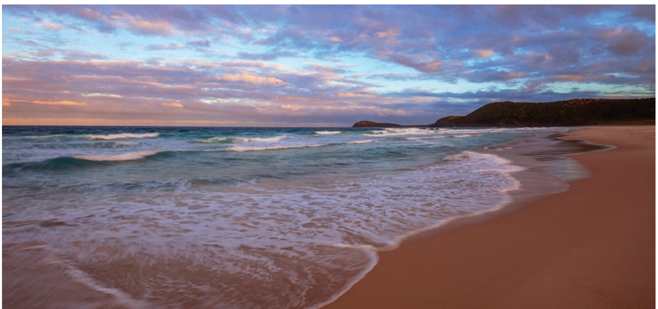
Sunset over Seven Mile Beach, Mid North Coast, New South Wales.