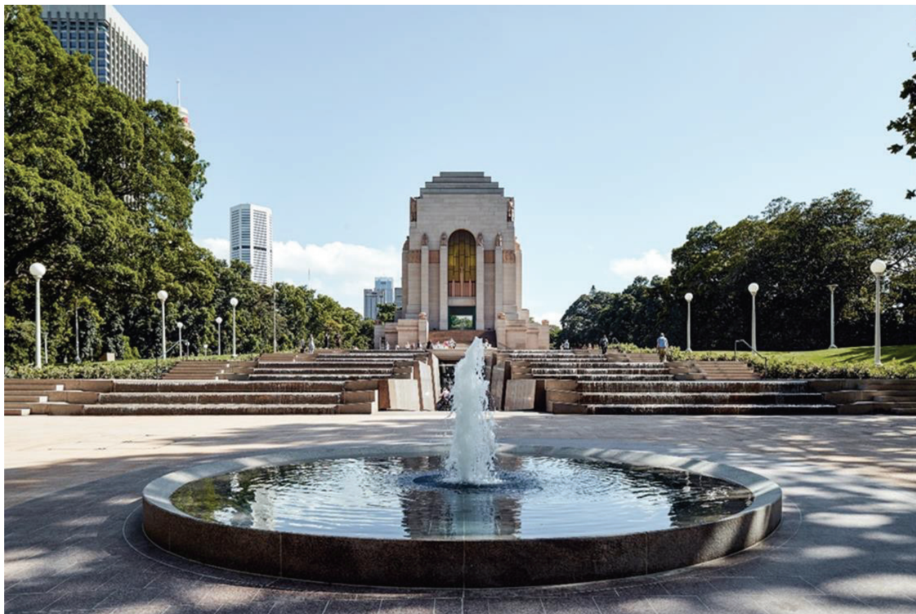
Anzac Memorial Hyde Park, corner of Elizabeth and Liverpool Streets, Sydney.