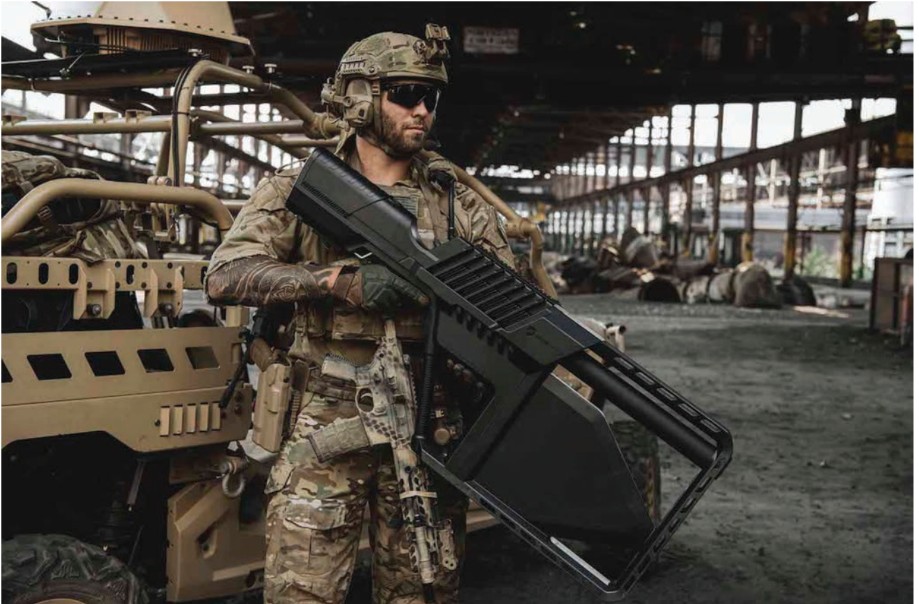
DroneShield's DroneGun Tactical, a long-range counter-drone system.