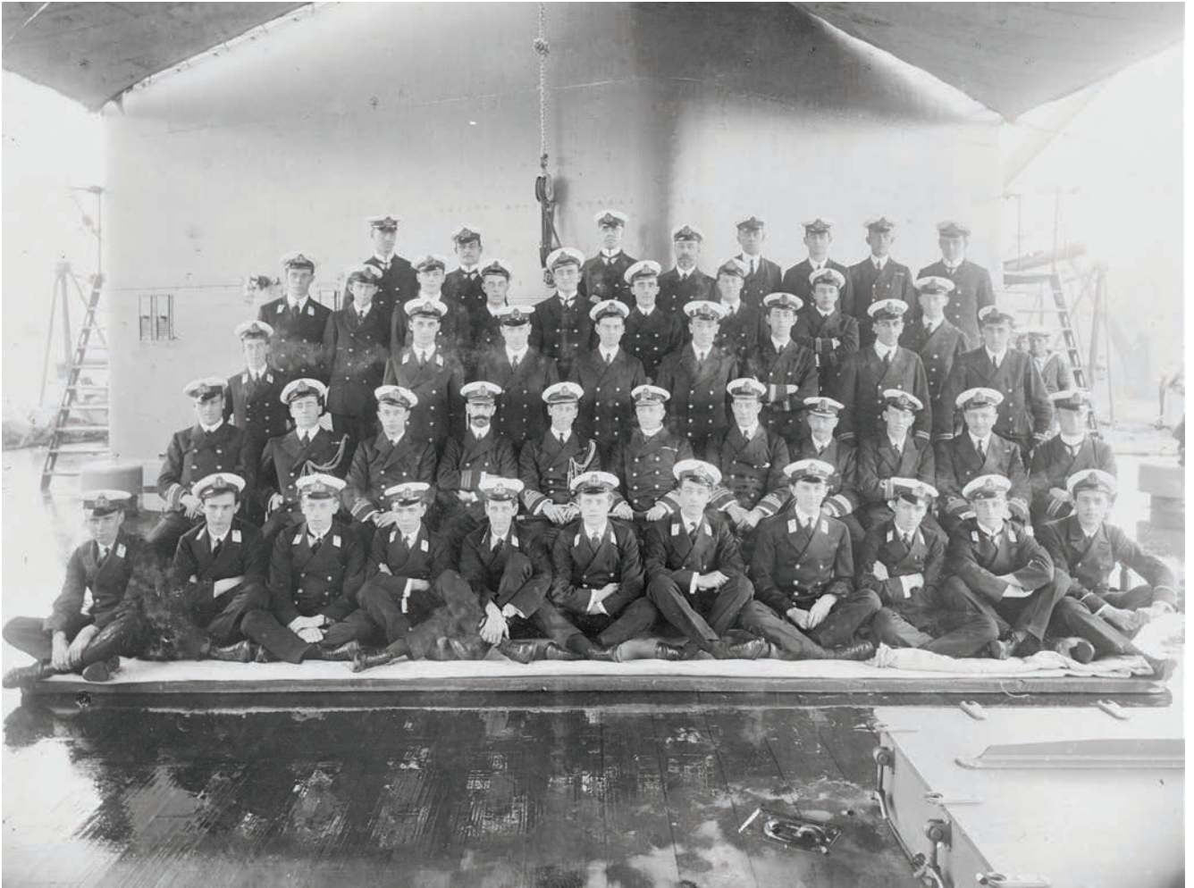
Rear Admiral Sir George Patey and Captain of HMAS Australia (I), c. 1913–1914, aboard flagship during fleet formation.

on 1 March 1901, when the Australian colonial forces amalgamated following Federation. At the time, they were known as the Commonwealth Naval Forces and Commonwealth Military Forces. Their current titles were officially granted in 1911 and 1980, respectively.