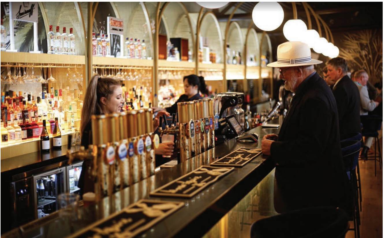
Orange Ex-Services' Club.

RSVP: wellbeing@tpinsw.org.au | 02 9235 1466